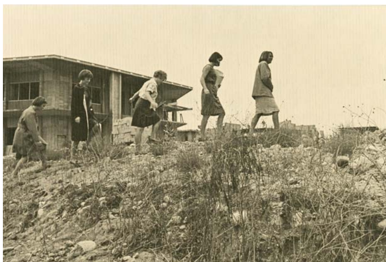
Education for the Twenty-First Century, Pitzer College, 1963

In September of 1964, Pitzer College opened its doors as a women's college. It wasn't until 1970 that Pitzer became a coed institution.